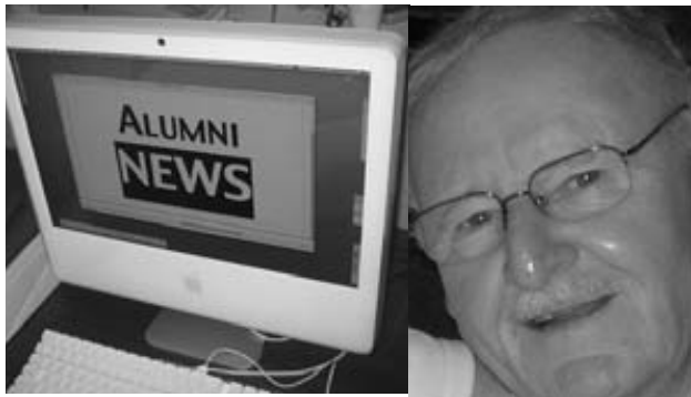
News and a bit of blarney from "The Prez's".... cluttered desk